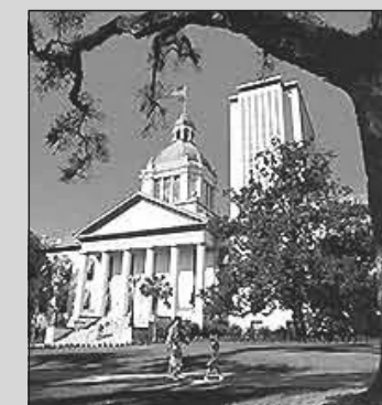
The old and new capitol buildings Tallahassee, Florida

Specific priorities being monitored by the League's paid lobbyist are election law, re-apportionment, the constitutional amendatory process, fiscal policy, tax reform, and campaign finance.